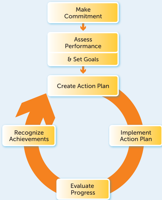
FIGURE 2 OVERVIEW OF ENERGY STAR GUIDELINES FOR ENERGY MANAGEMENT