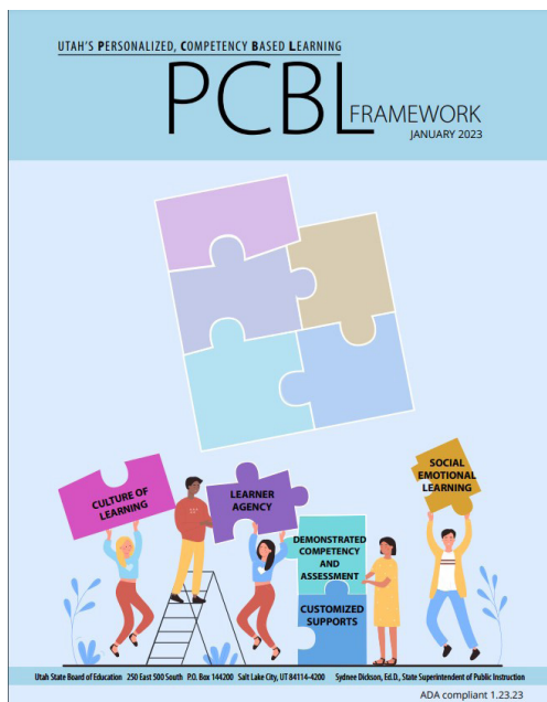
Figure 1: Two Frameworks Used by the Utah State Board of Education: Personalized, Competency Based Learning (PCBL) Framework and High Quality Instructional Cycle (HQI)