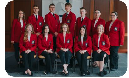
SkillsUSA Utah State Officer Team