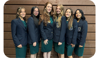
Utah DECA State Officer Team